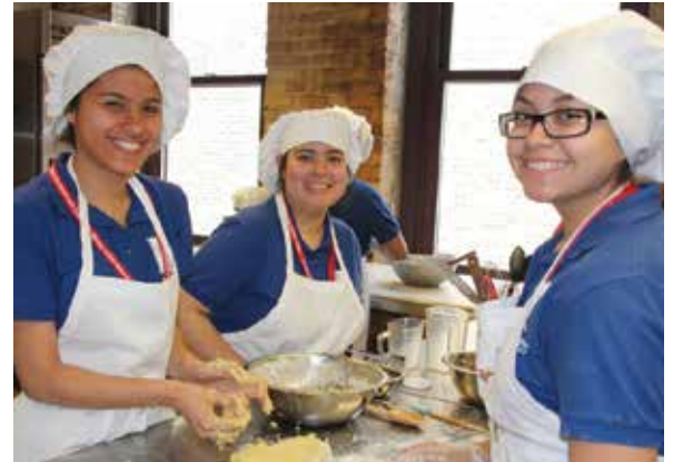
Hospitality apprentices at the Metro Achievement Center for girls.